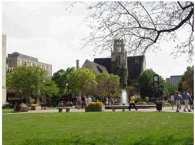
Students who satisfy the requirements for entry to Ontario universities are in a position to make applications to universities in other provinces, the United States and abroad. International universities require the OSSD to be completed. Most universities in the United States require standardized test scores (e.g. SAT/ ACT) to make admissions decisions.

Our Guidance Department counsels students throughout their university application process and oversees each application. Students are provided important information, such as the admission cut-off averages (which vary from year to year) for various faculties and universities, so that they can make wise choices regarding university and programme selection.