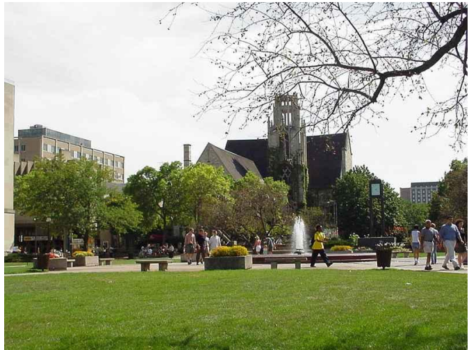
Students who satisfy the requirements for entry to Ontario universities are in a position to make applications to universities in other provinces, the United States and abroad. International universities require the OSSD to be completed. Most universities in the United States require standardized test scores (e.g. SAT/ ACT) to make admissions decisions.

Our Guidance Department counsels students throughout their university application process and oversees each application. Students are provided important information, such as the admission cut-off averages (which vary from year to year) for various faculties and universities, so that they can make wise choices regarding university and programme selection.