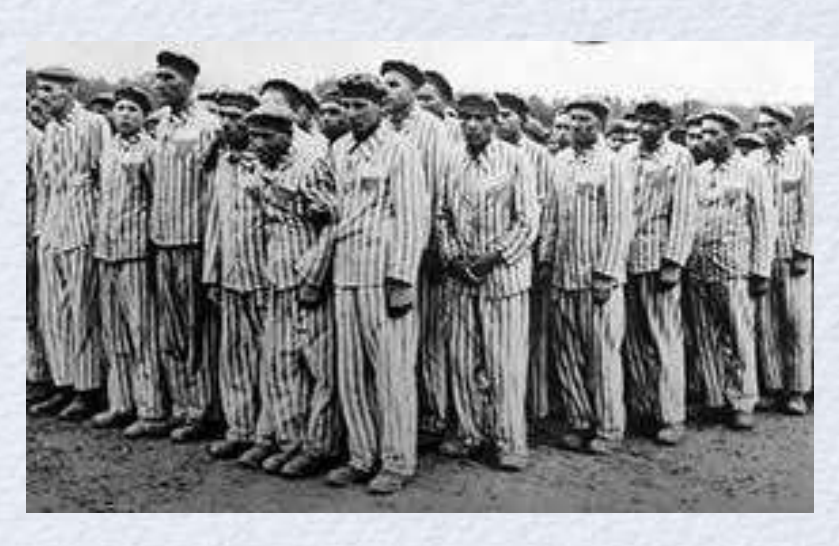
Another photo of Jews in their uniform