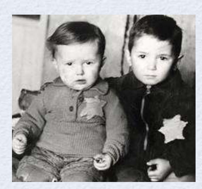
Jewish children during war