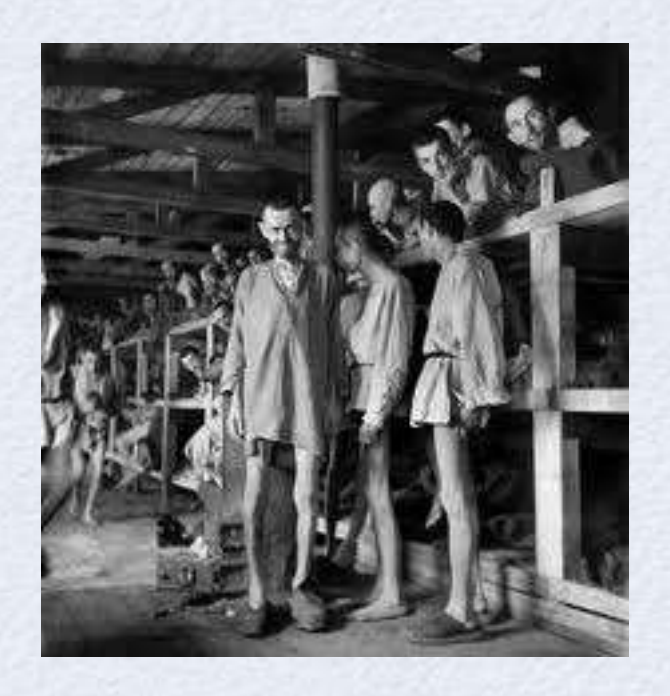
Sleeping arrangements in concentration camps