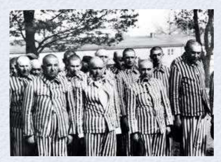
Jews in their designated uniform during war