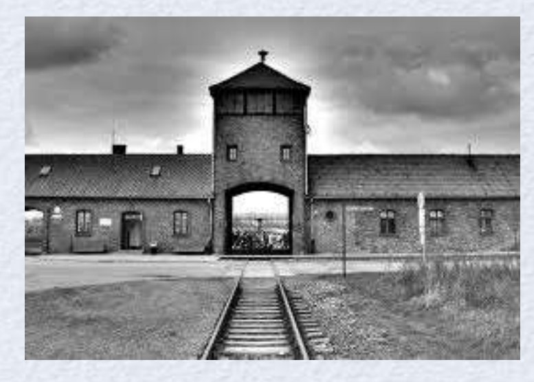
Famous concentration camp designed to look like a train station