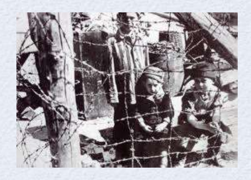
Jewish kids at concentration camp