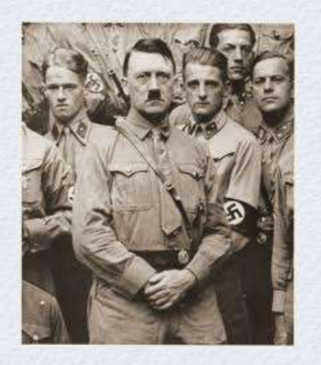
Hitler being photographed