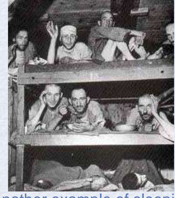
Another example of sleeping arrangements in concentration camps