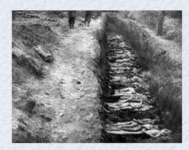
Example of how many deaths there were at camps