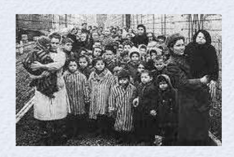
Jewish children during holocaust