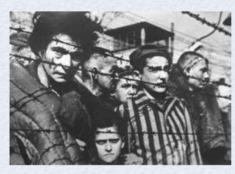
Jews trapped in Camps